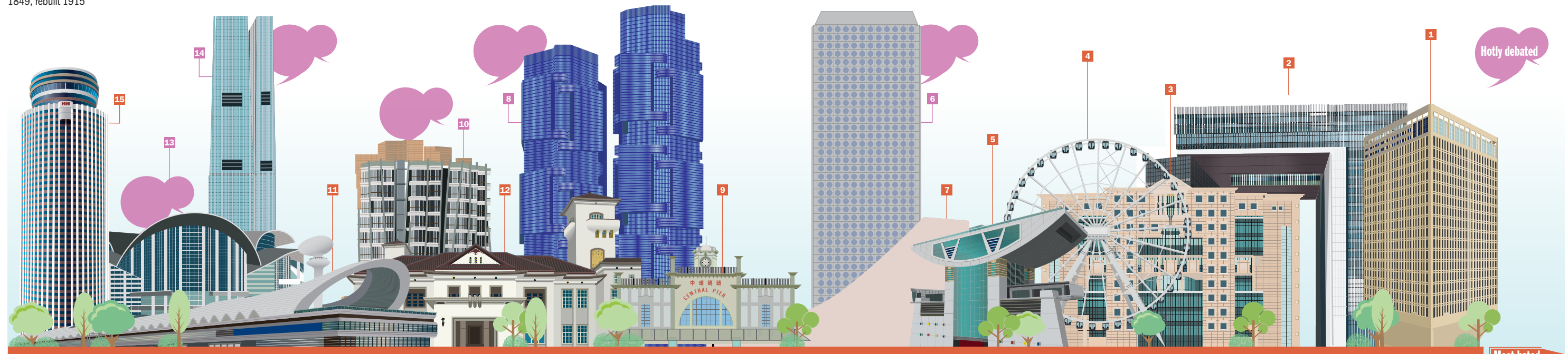
15 Hopewell Centre Gordon Wu, 1980